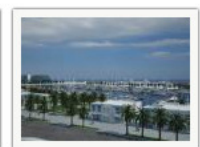
Ports & Marina's